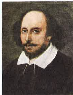
William Shakespeare 1564–1616

William Shakespeare is considered by many to be the world's greatest playwright. Shakespeare lived in England during the Renaissance, the blossoming of European learning that followed the Middle Ages. During the Middle Ages, the European world view had focused on God and the afterlife, but with the Renaissance came a renewal of interest in individual human achievement. This new emphasis spurred human beings to expand their horizons in all sorts of ways—scientifically, geographically, commercially, philosophically, artistically. In 1564, when Shakespeare was born, England had already embraced the spirit of Renaissance creativity. In the decades that followed, Shakespeare himself would help carry the Renaissance to even greater heights.