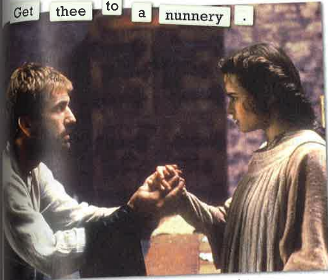
A scene from Franco Zeffirelli's 1990 film Hamlet