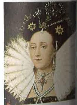
Queen Elizabeth I 1533–1603

During Elizabeth's reign, London, the capital of the nation, flourished as a great commercial center, the hub of England's growing overseas empire. London was also the hub of the artistic efforts that Elizabeth championed, and it attracted talented and ambitious individuals from all over the land.